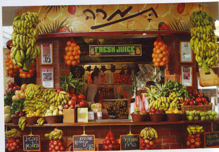
Tamara juice bar 2008

bike-friendly dimensions and overwhelmingly secular way of life.