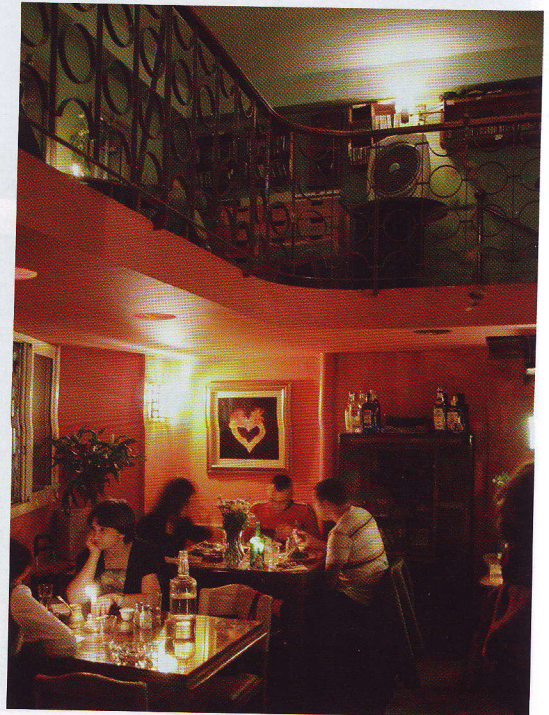
Joz & Loz restaurant 2008