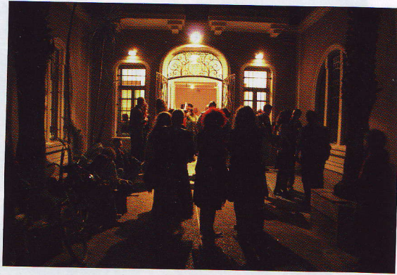
An exhibition opening at Sommer Contemporary Art 2008