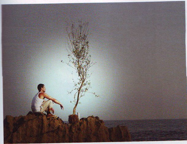
Yael Bartana A Declaration 2006 DVD still