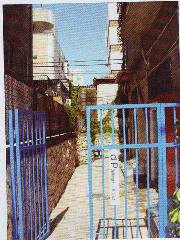
The entrance to the new premises of Dollinger Gallery 2008