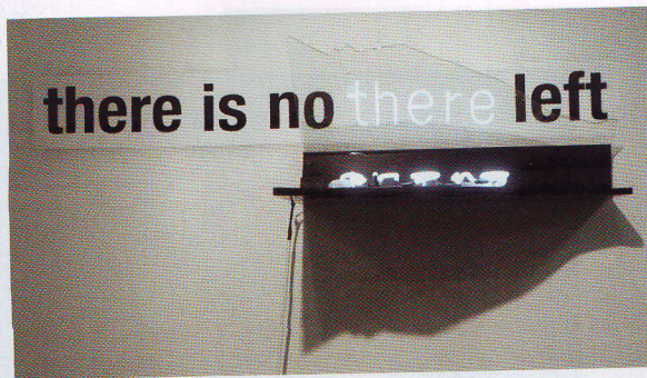
Miri Segal There Is No There Left 2008 Wood, glass, neon 50x70x45 cm