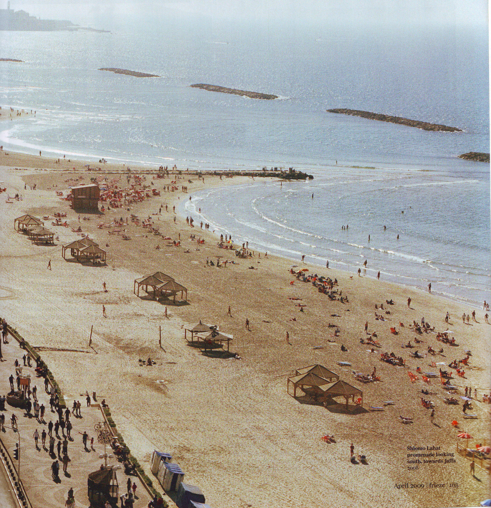
Shlomo Lahat promenade looking south, towards Jaffa 2008

Israel's second largest city is known as 'the bubble' for its air of detachment from political turmoil, its hedonism, cosmopolitanism and vibrant art scene by Nait Banai, Eyal Danon and Galit Eilat