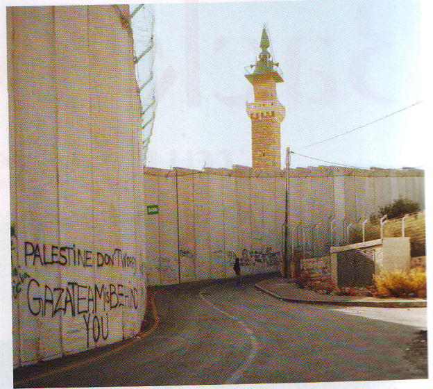
The West Bank barrier, Jerusalem 2008