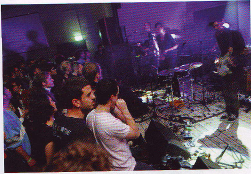
A performance by Eferklang, c-sides Festival 2009