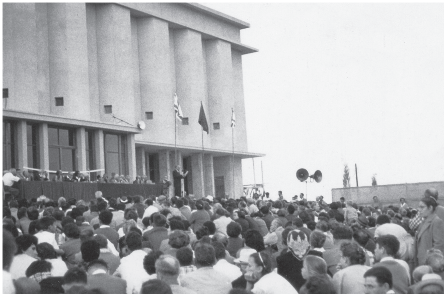
Fig. 2. The inauguration of the new building of the Ghetto Fighters' House Museum, 1958, Israel, photograph.

The Ghetto Fighters' Kibbutz, on the other hand, offers a more successful model in establishing a museum on kibbutz grounds. Yitzhak Cukierman (Antek) (1915–1981) was one of the leaders of the Warsaw Ghetto Uprising, and a friend of Kovner's. Both of them arrived in Palestine in the same period. Only a few years later, in 1949, he was among the founders of both the Ghetto Fighters' Kibbutz and of the institute for Holocaust documentation and commemoration, the Itzhak Katzenelson Holocaust and Jewish Resistance Heritage Museum, which is still known as the Ghetto Fighters' House Museum (fig. 2). The establishment of this museum became possible not only because of the