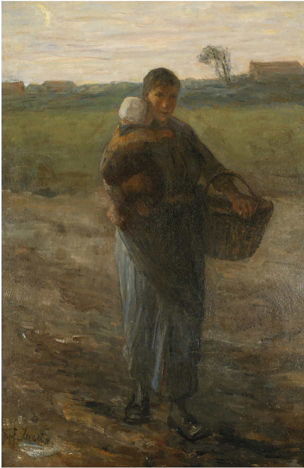
Fig. 7. Jozef Israëls, On the Way , 1885, oil on canvas, 91×61 cm. Collection of Mishkan Museum of Art, Ein Harod.

been preserved by the Jewish communities since the 16th century may be removed from here. 22