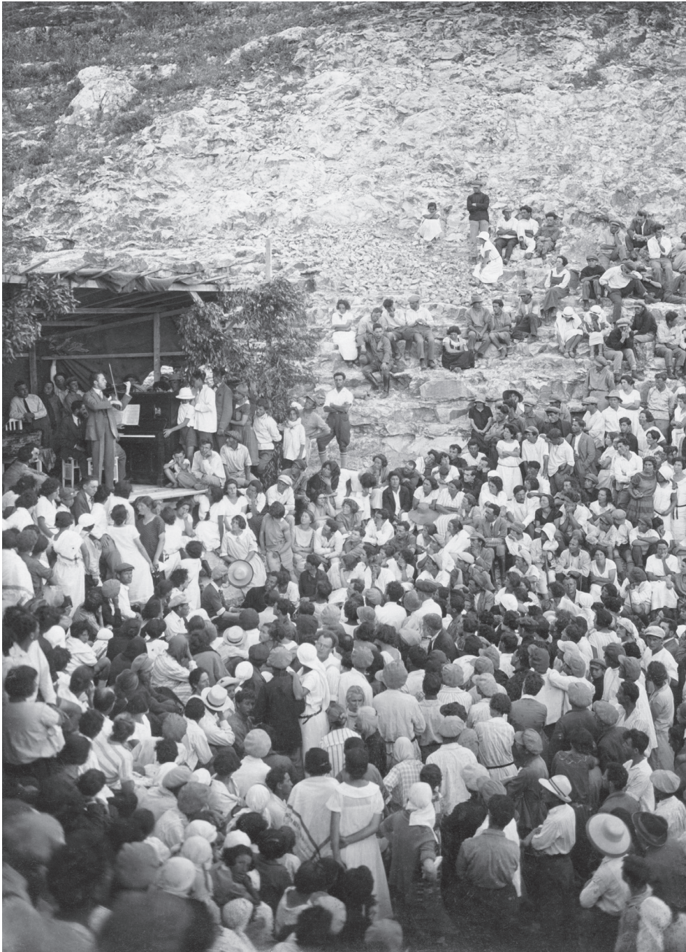
Fig. 4. Jascha Heifetz concert at the quarry in Gilboa, 1925, photograph.