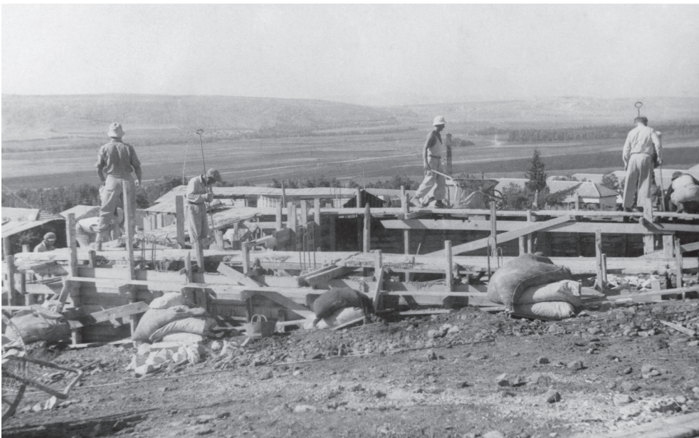
Fig. 6. Laying the foundations for the permanent building of the Mishkan Museum of Art, Ein Harod, 1947, Ein Harod, photograph.