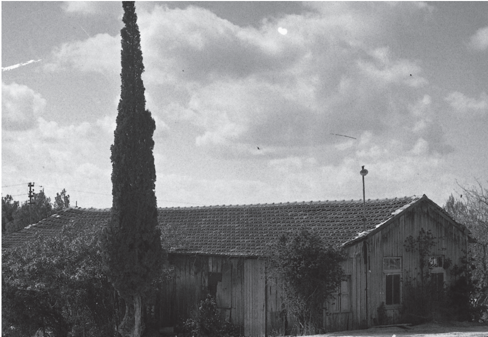
Fig. 5. The hut of the Mishkan Museum of Art, Ein Harod, early 1940s, Ein Harod, photograph. (Courtesy of the Archive of the Mishkan Museum of Art, Ein Harod).