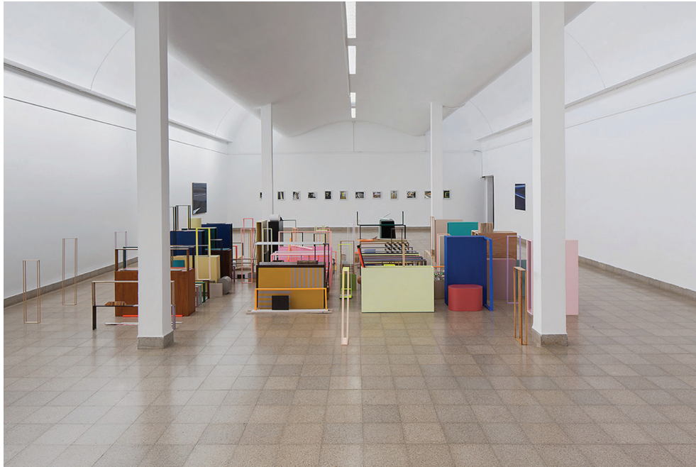
Fig. 3. Elad Sarig, View of a museum gallery, installation: The Rough Law of Garderns: Holzapfel and Tevet , 2016, Mishkan Museum of Art, Ein Harod, Israel, photograph.

thought that the establishing of a museum requires the existence of sufficient conditions such as a large population, a concentration of capital, and a social elite's need to define itself as a separate class, as well as the activity of an "obsessed individual."