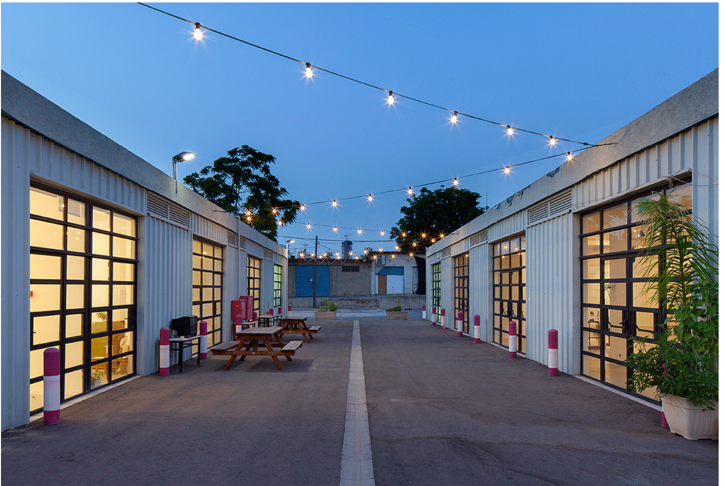
Artport, Tel Aviv. Photo courtesy of Artport.

Tel Aviv is also home to Artport, a relatively new but growing residency program led by Vardit Gross. In two large, long buildings resembling dressed-up suburban storage facilities, Artport's residents work side-by-side in studios, with the long open-air space between the buildings acting as a common area. Current residents include Tamir Zadok, creator of the Gaza Canal (2010), a satirical video documenting the separation of Gaza from the rest of Israel through the means of a canal.