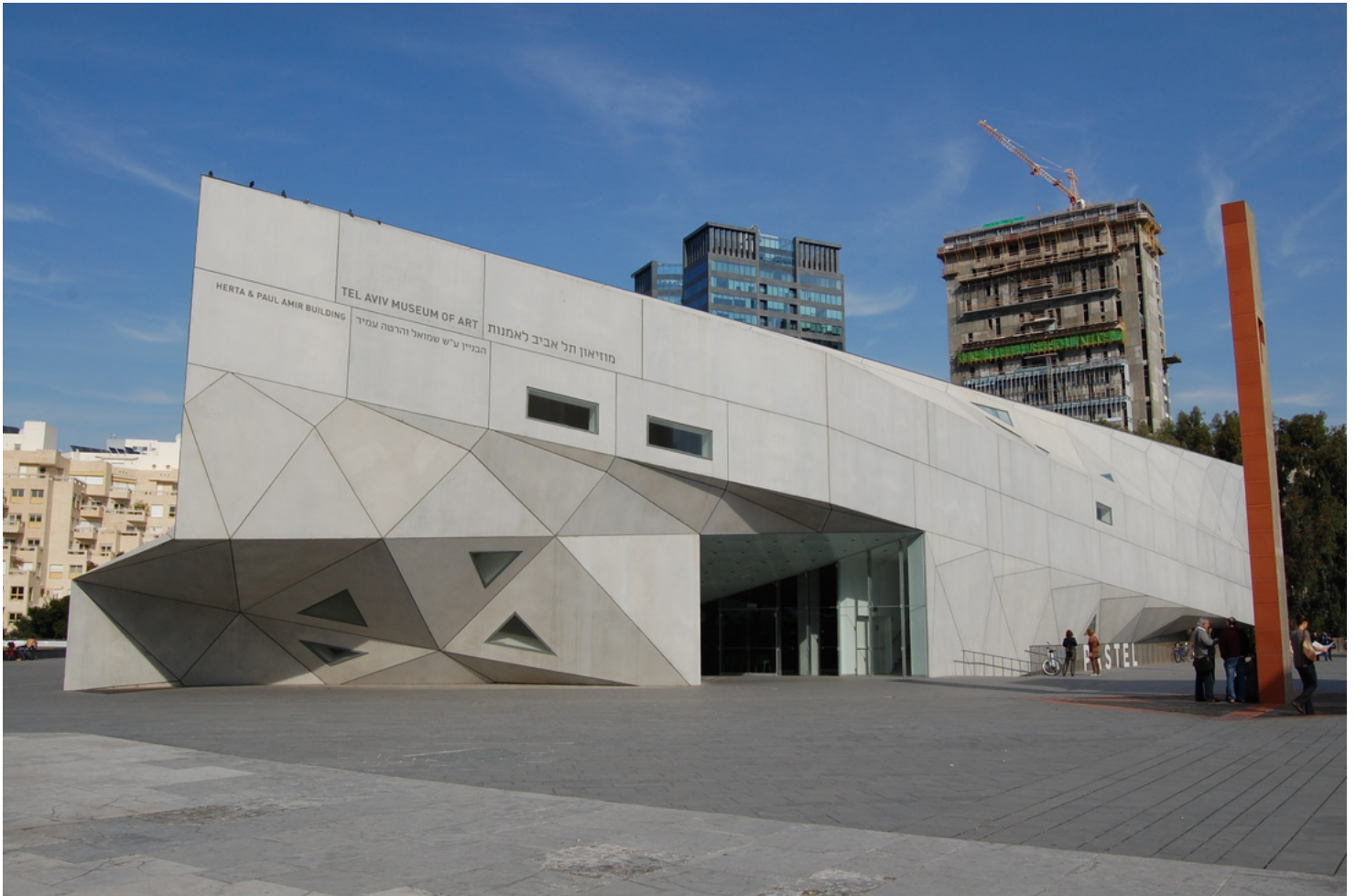
Photo of the Tel Aviv Museum of Art by Andrzej Wójtowicz via Flickr.

The Tel Aviv Museum of Art, Israel's premier modern and contemporary art institution, lies at the heart of the city's art ecosystem. Founded in 1932, it is situated on Shaul Hamelech Boulevard, not far from "The Campus," an area containing Tel-Aviv's government buildings and the Israel Defense Forces base. After a 2011 renovation and expansion, it's now housed in one of the country's most impressive buildings, designed by architect Preston Scott Cohen. The faceted gray structure features 200,000 square feet spread across five floors of large, light-filled galleries organized around a spiraling 87-foot-tall atrium.