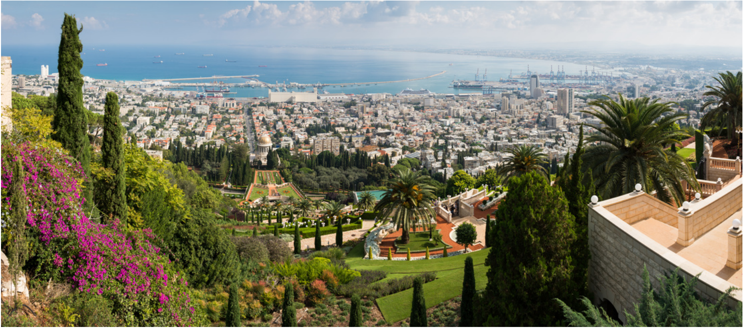
View of Haifa from Yefe Nof promenade.

It's also worth taking a short trek north of Tel Aviv and Jerusalem, to Beit Hagefen in Haifa and the Museum of Art, Ein Harod—one of the first art museums in Israel, originally founded in a hut on the site of the Kibbutz Ein Harod. In 1948, the museum made its home in a permanent building designed by architect Samuel Bickels. One of the earliest examples of an exhibition space relying primarily on natural lighting, it became an inspiration for Renzo Piano's De Menil Museum in Houston in the 1980s.