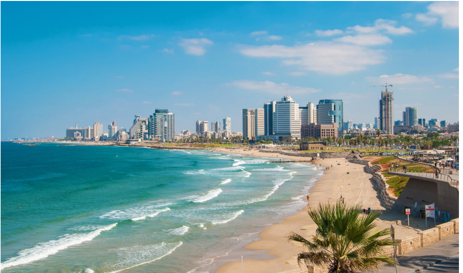
View of the waterfront and beaches of Tel Aviv.

Israel's art scene largely revolves around Tel Aviv, the country's beach-oriented, gay-friendly, nightclub-filled cultural nexus. Alongside an impressive array of museums, galleries, and residencies, the city is also home to a trove of iconic Bauhaus buildings (some 4,000, together dubbed the "White City"), a growing cache of world-class restaurants, and long stretches of sand that border the city center. The palm-dotted metropolis is also somewhat insulated from the conflicts engulfing the rest of the country and wider region.