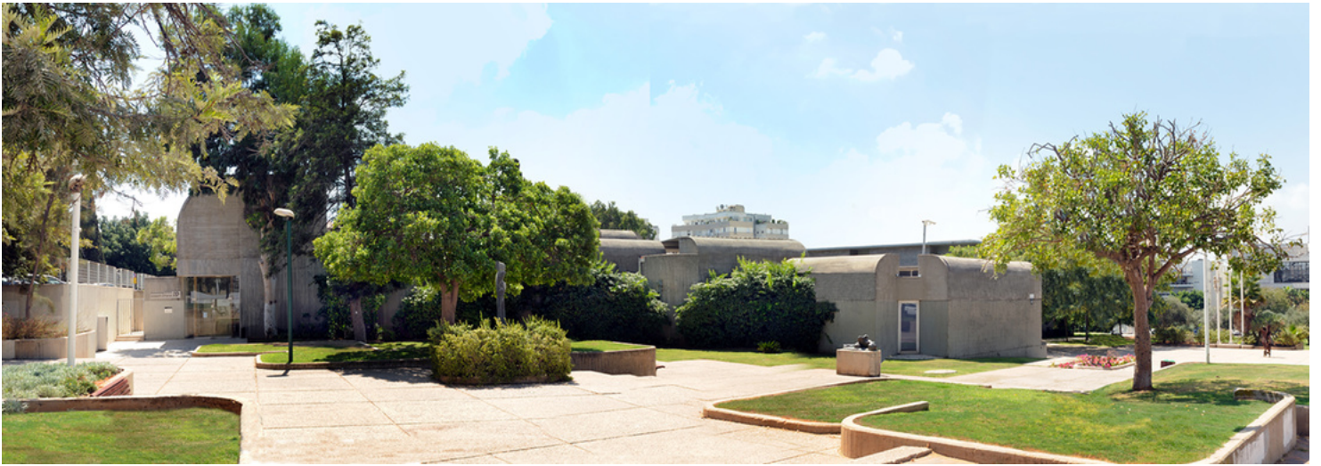
Exterior of Herzliya Museum of Contemporary Art