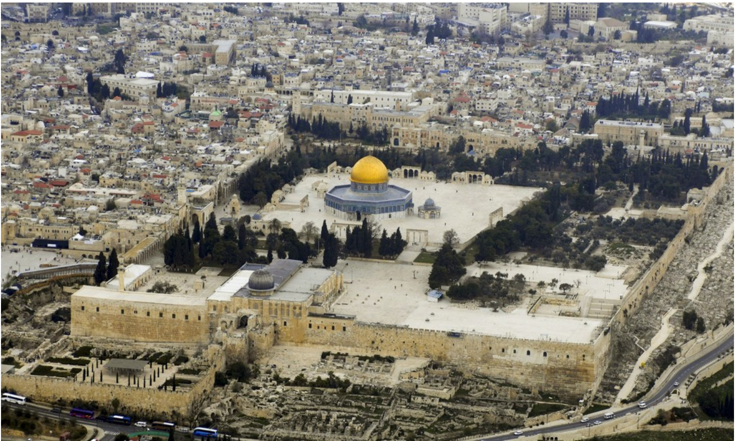
Aerial view of Haram Al-Sharif (Temple Mount) with Dome of the Rock Jerusalem, Israel

While Israel's art scene is currently centered in Tel Aviv and its suburbs, Jerusalem's encyclopedic Israel Museum, the country's largest cultural institution (which celebrated its 50th anniversary this year), is changing that. Entering the museum's grounds, which lead you up to a hilltop overlooking West Jerusalem, two monumental reflective sculptures by Jeff Koons, and a work by Anish Kapoor, greet you. The Kapoor is especially powerful; perched at the apex of the hill, it reflects the rocky landscape that surrounds the museum complex and the ancient city that sits below, nestled between the Mediterranean and Dead Seas.