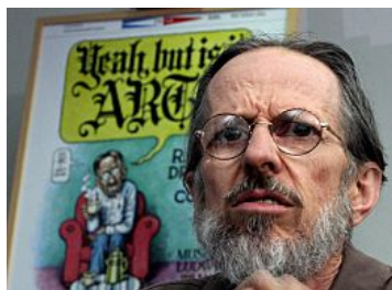
Legendary Cartoonist Robert Crumb on the Massacre in Paris