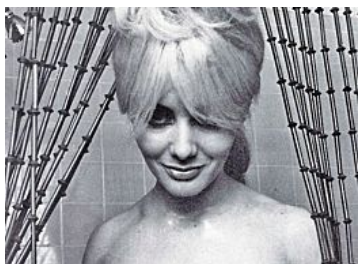
Carol Doda, Big-Boobed Bombshell Pioneer of Topless