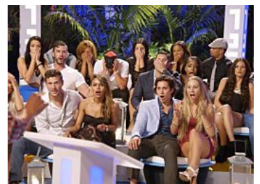
MTV's 'Are You the One?' Host Ryan Devlin Dishes On the 'Jaw-