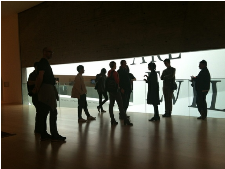
Visit to the Tel Aviv Museum of Art, Artis Research Trip to Israel, January 2013.